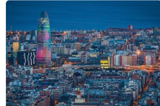
Agbar Tower, Spain

The role will involve occasional UK and international travel to support facilities operations, projects and business requirements across Rapidrop's global network.