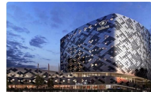
Hilton Airport, Amsterdam, Netherlands