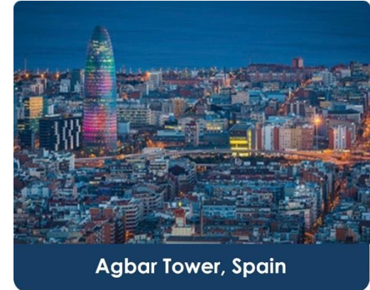
Agbar Tower, Spain

The role will involve occasional international travel to support warehouse operations, logistics partners, operational projects and business growth initiatives.