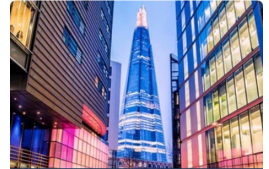
The Shard, United Kingdom

Today, our teams operate across the UK, Europe, the Middle East and South Africa, supported by continued investment in our UK headquarters, including a fully refurbished modern office environment. With a collaborative culture and a growing international footprint, Rapidrop offers an exciting opportunity to contribute to a business focused on innovation, growth and protecting people and property worldwide.