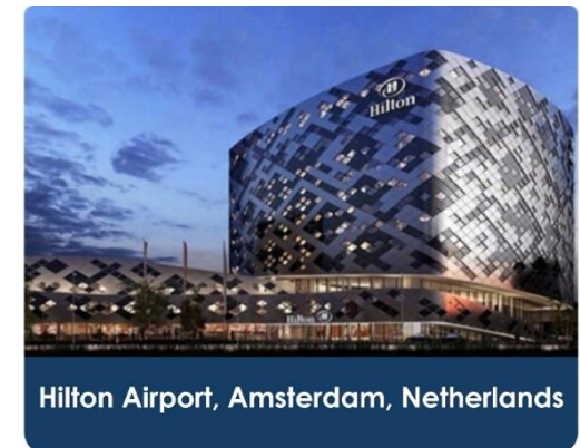
Hilton Airport, Amsterdam, Netherlands