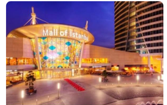
Mall of Istanbul, Turkey