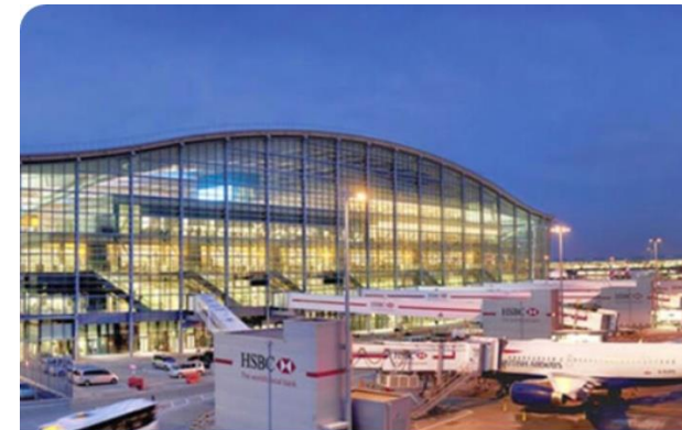
Heathrow Airport, Terminal 5, United Kingdom