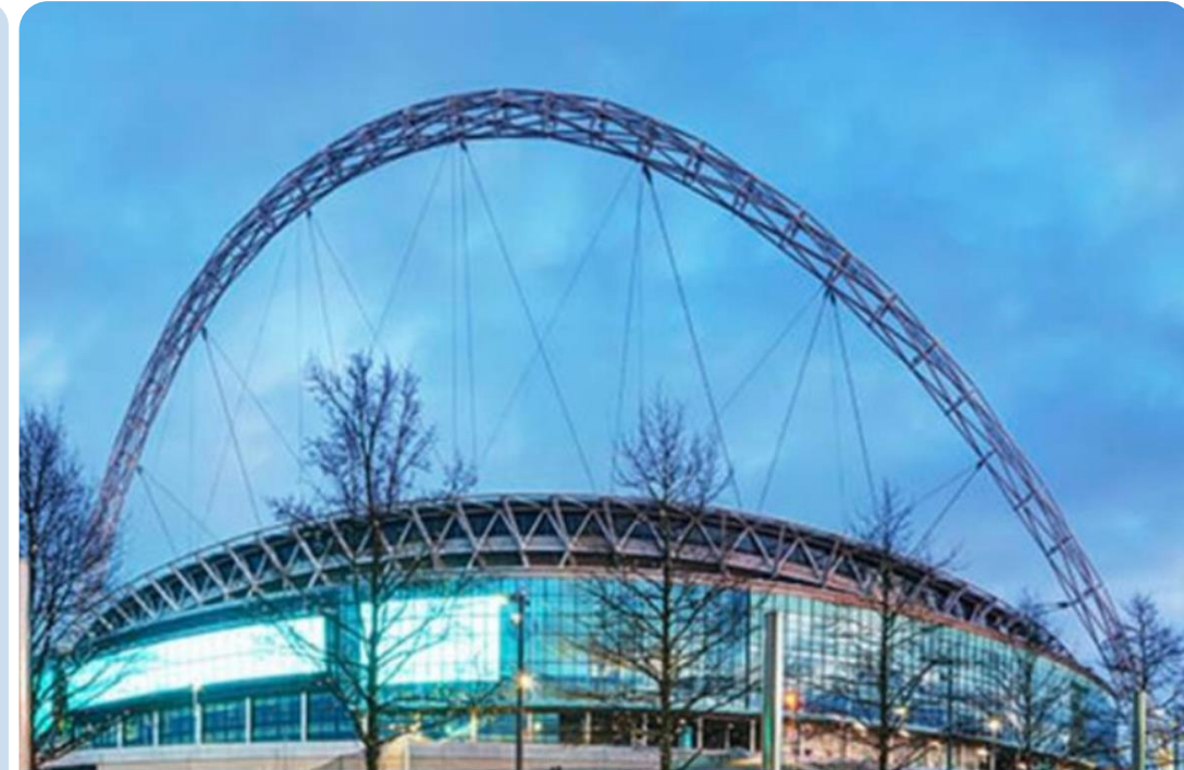
Wembley Stadium, United Kingdom