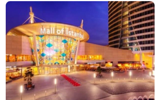
Mall of Istanbul, Turkey