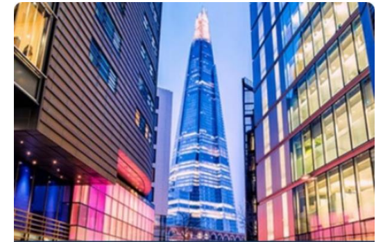
The Shard, United Kingdom

Today, our teams operate across the UK, Europe, the Middle East and South Africa, supported by continued investment in our UK headquarters, including a fully refurbished modern office environment. With a collaborative culture and a growing international footprint, Rapidrop offers an exciting opportunity to contribute to a business focused on innovation, growth and protecting people and property worldwide.