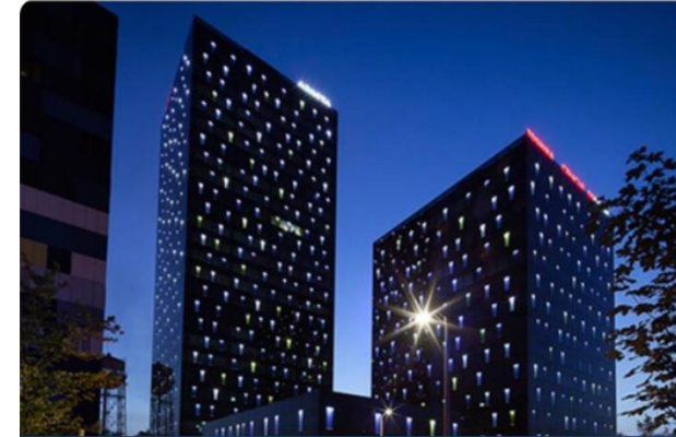
VIMD Kwart, Zagreb, Croatia