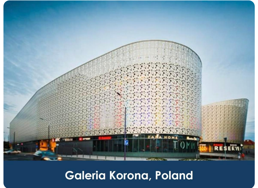
Galeria Korona, Poland