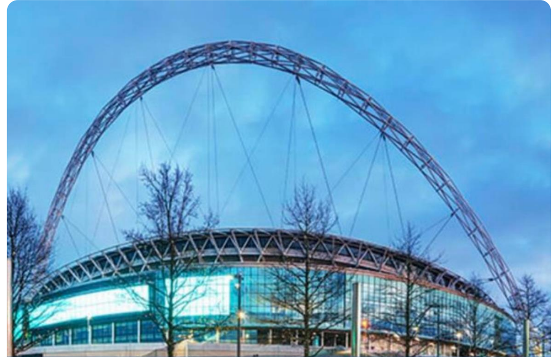
Wembley Stadium, United Kingdom