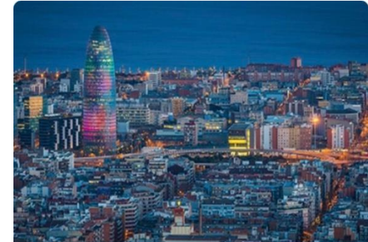
Agbar Tower, Spain

This is an exciting opportunity for a commercially minded marketing professional who thrives in a fast-paced, collaborative environment and enjoys delivering marketing initiatives that create measurable impact. The role will also involve international travel to Rapidrop locations and key markets to support collaboration, global campaigns, trade exhibitions and business development activity.