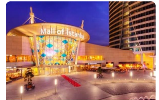
Mall of Istanbul, Turkey