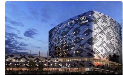
Hilton Airport, Amsterdam, Netherlands