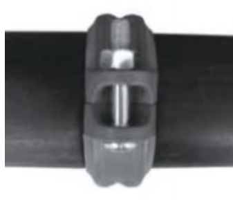
7. Assembly Completed Rigid Coupling

Firstly hand tighten nuts and make sure oval neck bolt completely fits into bolt hole. Then securely tighten nuts alternatively and equally to the specified bolt torque by using spanner.