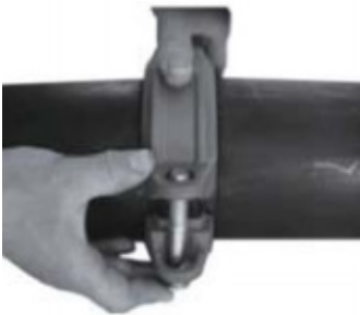
5. Housing Installation

After aligning two pipe ends together, pull the gasket into position, centering between the grooves on each pipe. The gasket should not extend into the groove on either pipe.