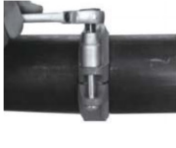
6. Tighten Nuts

Remove one bolt&nut and loosen the other nut. Place one housing over the gasket, making sure the housing keys fit into the pipe grooves. Swing the other housing over the gasket and into the grooves on both pipes. Re-insert the bolt and connect two housings.