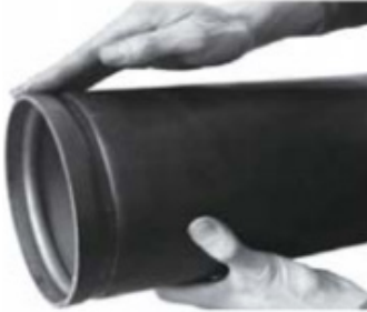
1. Pipe Preparation

Check pipe end for proper groove dimensions and to assure that pipe end is free of indentations and projections that would prevent proper sealing.