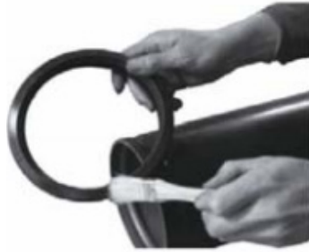
2. Lubricate Gasket

Check pipe end for proper groove dimensions and to assure that pipe end is free of indentations and projections that would prevent proper sealing.