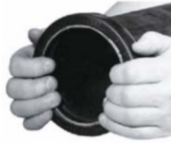
3. Gasket Installation

Check gasket to be sure it's compatible for the intended service. Apply thin lubricant to the outside and sealing lips of the gasket.